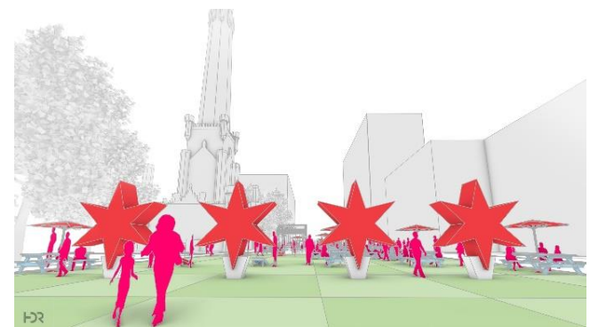
Illustrative view of upcoming street activation. Rendering by HDR

"Meet Me on The Mile" is a new series of activations along Michigan Ave this summer and fall, which will invite residents and tourists downtown for performances, family activities, Instagrammable installations, dining, and shopping.